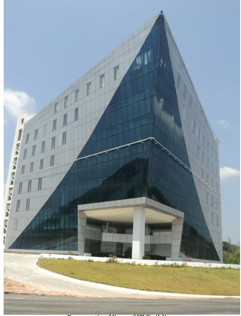
Perspective View of IT Building.