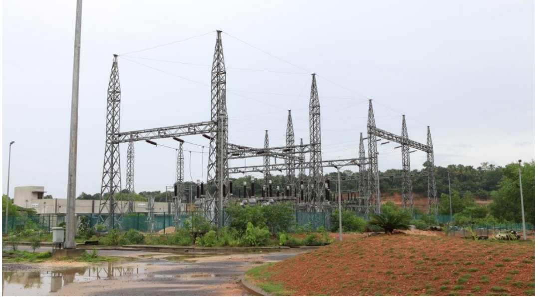
Work progress of 110 kv Substation.