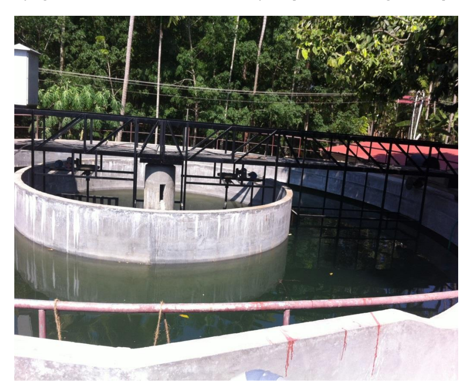
Treatment Plant: Clarifier Work in Progress

KWA will be executing the work in 4 separate packages from which work under two package viz. treatment plant and pipe laying works has already been awarded and the work is progressing. Pipe laying for 3km stretch out of 11km is already completed. Tendering of other packages is in progress.